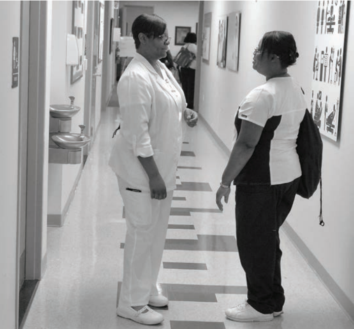
Fort Lauderdale Campus